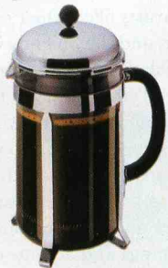
Bodum coffee press

Pick up a sleek accessory or home accent at Blend.