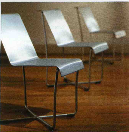
Emeco "Superlight" chair